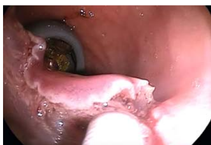
► Fig. 3 Endoscopic image showing colonic endoscopic submucosal dissection with percutaneous intragastrintestinal trocar (PIT) assistance.