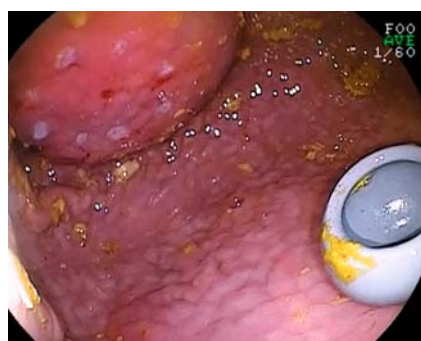
► Fig. 1 Endoscopic image showing a gastric port in the wall contralateral to the marked lesion.

Minimally invasive endoscopic procedures are associated with fewer adverse events and shorter hospital stays compared with surgery [1]. However, some advanced endoscopic procedures, including endoscopic submucosal dissection (ESD), require specialized training and significant experience to achieve competency and are not widely performed in non-specialist centers [2].