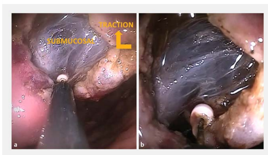
► Fig. 2 Images during endoscopic submucosal dissection with percutaneous intragastrintestinal trocar (PIT) assistance showing: a the use of a grasper through the PIT, which allows traction on the lesion to improve visualization and tissue tension to enhance dissection; b improved exposure of the submucosal layer.

Under endoscopic visualization, an intragastrintestinal port (3.8 mm/11 Fr) was placed in a fashion similar to that of a standard PEG in the contralateral wall of